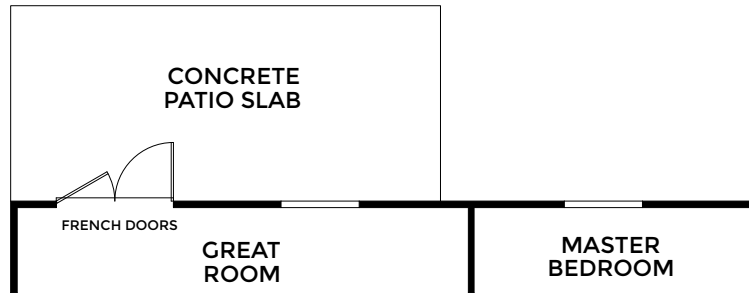
OPTIONAL PATIO SLAB AT ELEVATION R