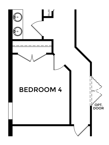
OPTIONAL BEDROOM 4