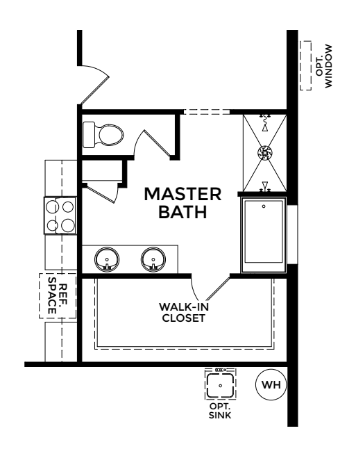
OPTIONAL DELUXE MASTER BATH